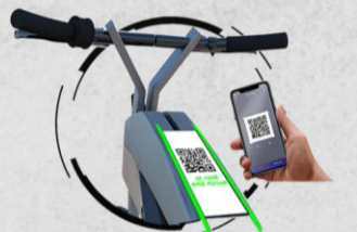
E-Bike With QR Code