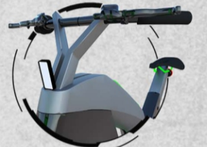
Bike Light Installation