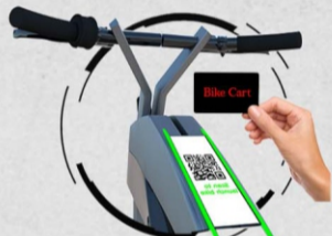
Local Tap Card