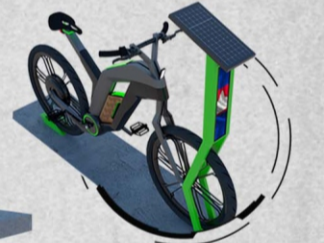
Bike Stop With Solar System